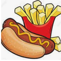
Concessions are OPEN!